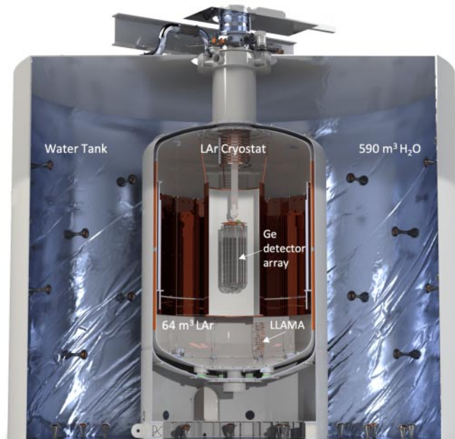
Fig. 1. – Schematic representation of the LEGEND-200 setup at LNGS.

new system allows to monitor continuously the LAr quality, providing the triplet lifetime, the relative light yield and the attenuation length.